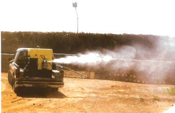
Cold Fogging/Aerosol Technique 20 - 200 Microns Droplet Size