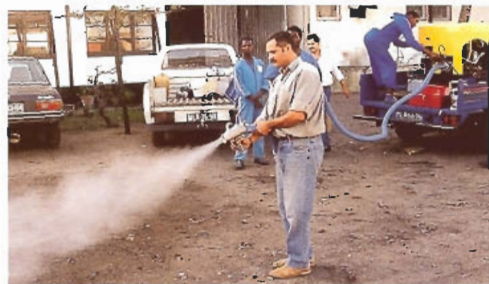
Conventional/High Volume Spraying Technique 100 - 500 Microns Droplet Size