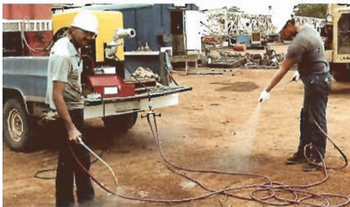
Larvaciding/Residual Spraying Technique 100 - 300 Microns Droplet Size

★★★★ FREE LIFETIME FIELD BACKUP SERVICE ★★★★★