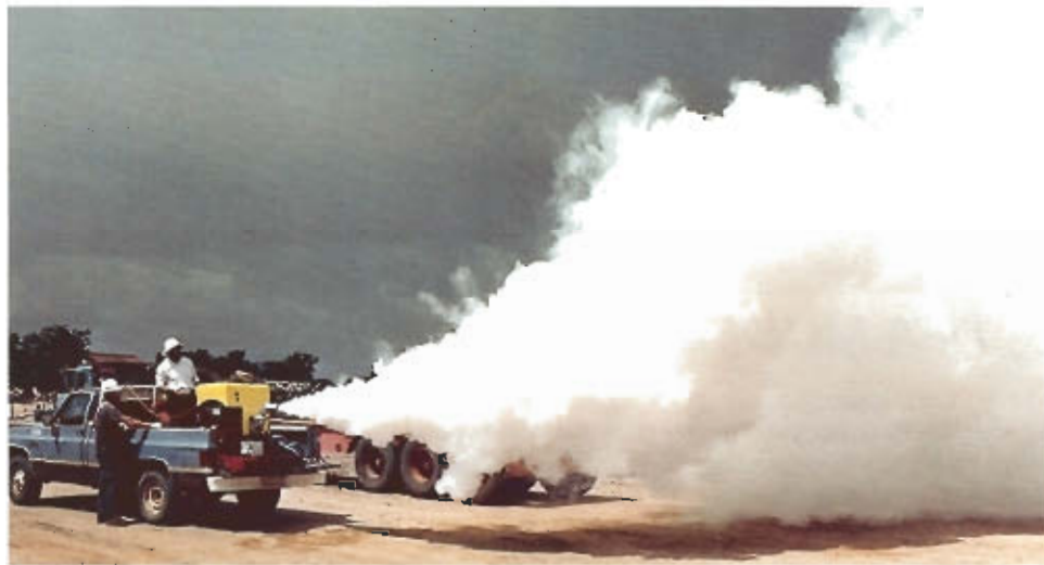
Thermal Fogging Technique 1 - 50 Microns Droplet Size